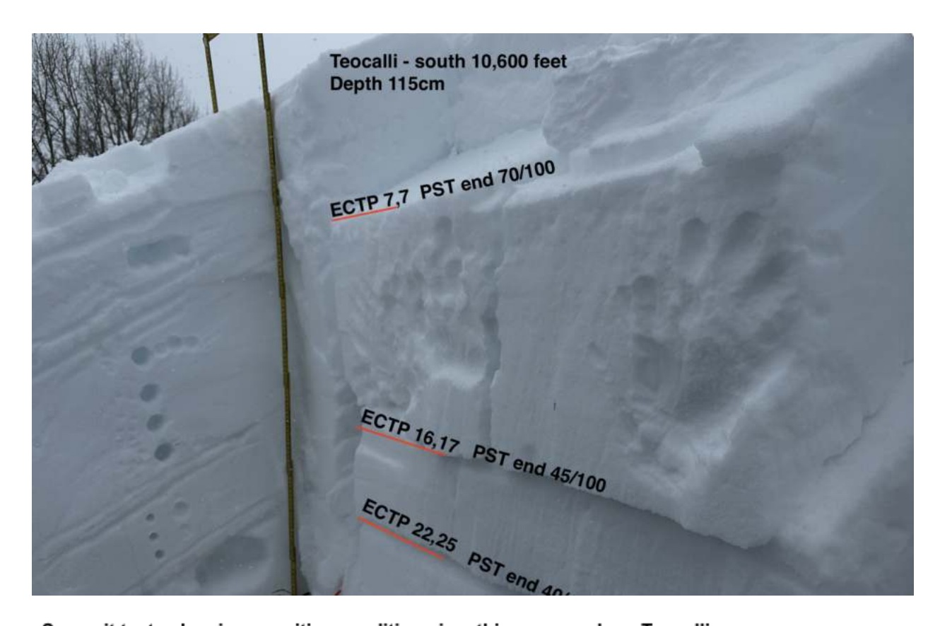
Snowpit tests showing sensitive conditions in a thin snowpack on Teocalli

Southwest winds on Saturday night began pumping moisture into the area with a few inches falling overnight. Snowfall picked up over the course of the day and Irwin Cat Ski reported 10" of new snow by the end of the day, an observer in Brush Creek reported 5" of new snow, and Gothic clocked in with 1-2" of new snow. Winds remained light from the Southwest. No avalanches were reported today, but the CBAC observed noticeable sensitivity to triggering avalanches in shallow terrain where trigger points are more easily affected.